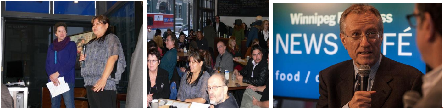
Above photos taken at the release of the Manitoba Child and Family Poverty Report Card, November 2012

The Manitoba Child and Family Report Card released on November 29/12 was well covered in the local media, including comments by Senator Art Eggleton. Senator Eggleton also participated in a News Café that was pod cast. We have a few other projects in the works; tracking the Federal cuts to Manitoba and creating a presentation making the business case for ending poverty, based on our 2012 Poverty Report Card and other information.