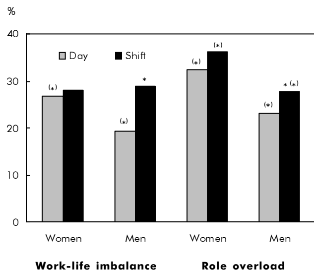
Chart C Regardless of schedule, women more likely to have work-life imbalance or role overload

* significantly different from regular day schedule (* significantly different from opposite sex